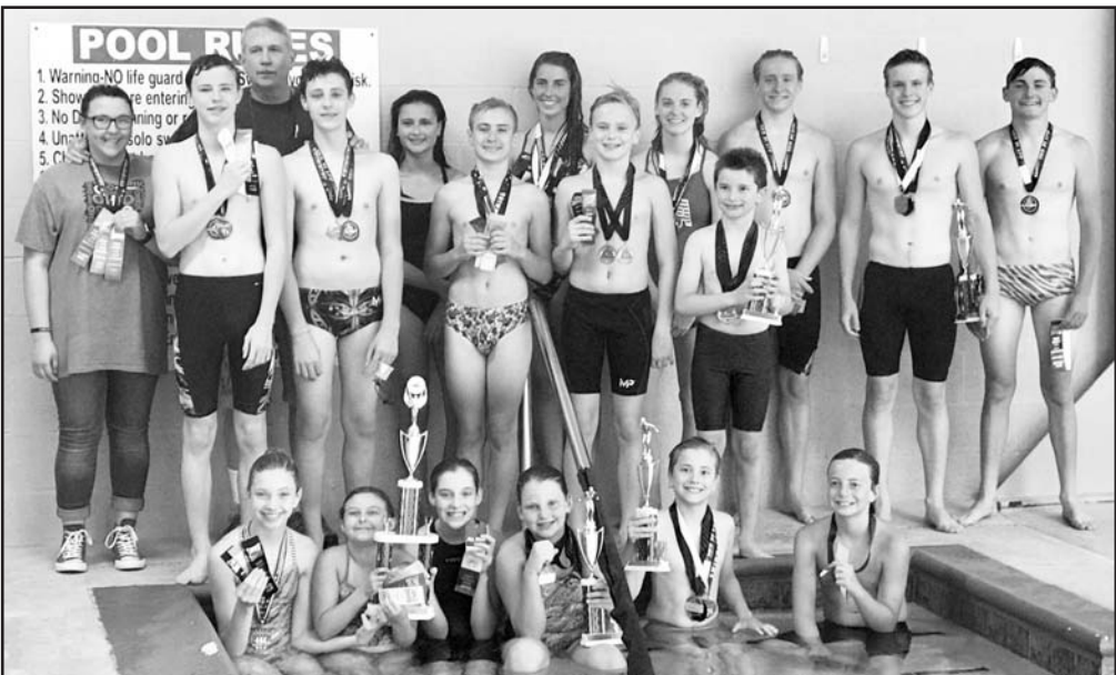
North Georgia Rapids Swim Team

The North Georgia Rapids Swim Team finished the summer short course swim season with an excellent showing. The "Rapids" brought home a third place trophy in their division of twelve teams located throughout northern Georgia. In all, fifteen teams participated in the two day swim meet. Although our local team is smaller in size than most other teams, the Rapids swimmers made up